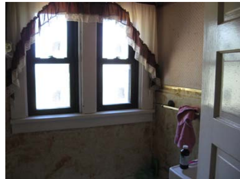
Bath – 6'5" x 5'