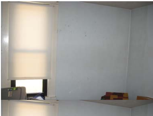
Bedroom – 7'10" x 11'8"