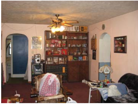
Living /Dining Room – 23'7" x 12'