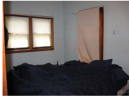
Bedroom – 8'11" x 16'9"