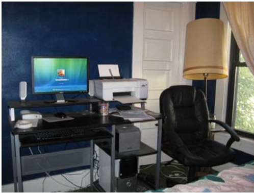
Bedroom – 9' x 9'