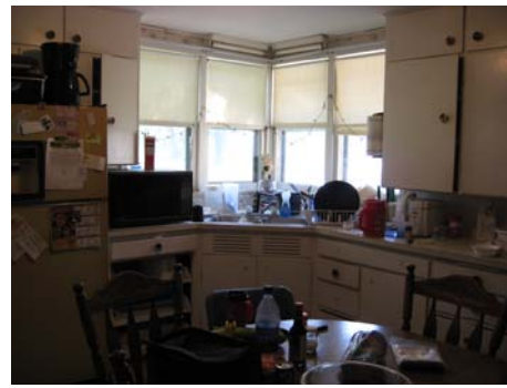
Kitchen – 11' 7" x 15'7"